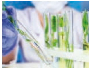
Research and Development