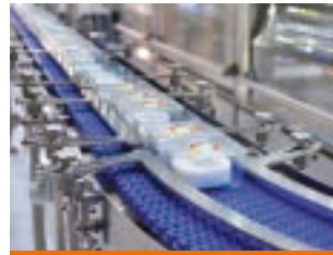
Packaging Machinery and Materials