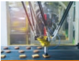
Automation and Robotics