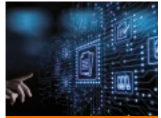
Digitalization and Data Management