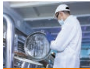
Quality Management and Food Safety