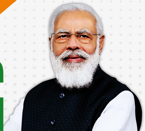
- Narendra Modi Hon’ble Prime Minister of India

“India’s Aviation Sector is growing tremendously, this makes quality infrastructure in aviation sector of prime importance.”