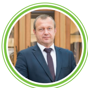
Smilgin Ivan Ivanovich

First Deputy Minister of Environmental Protection and Agriculture of Georgia