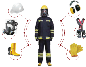
Fire Protection & PPE