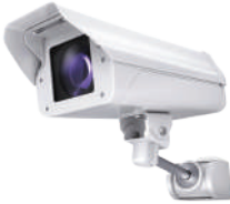
Security Systems and Services