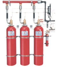
Fire Protection Equipment